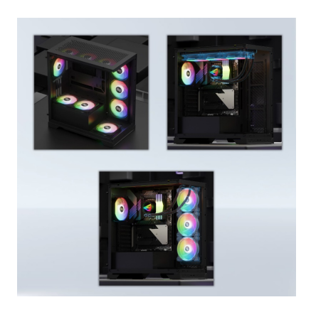
Enhanced Cooling for Better Performance