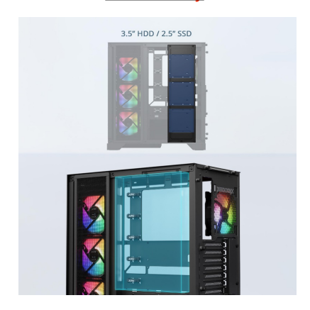
Supports the Latest Motherboards