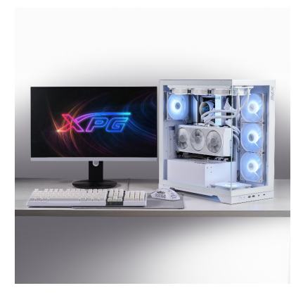
Next Gen Ready