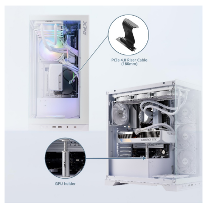
Install GPU Vertically Or Horizontally