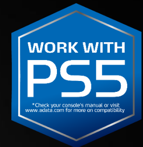
PS5 M.2 SSD SLOT VIEW