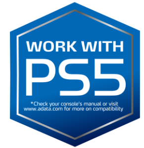
PS5 M.2 SSD SLOT VIEW