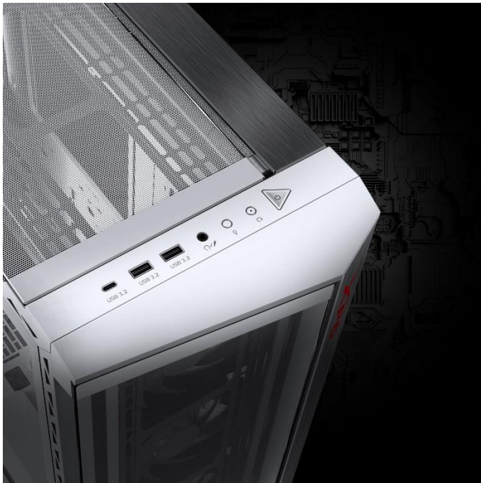
Efficient I/O Panel Design