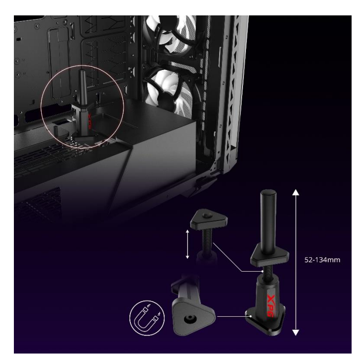
Strong, Adaptable Graphics Card Holder