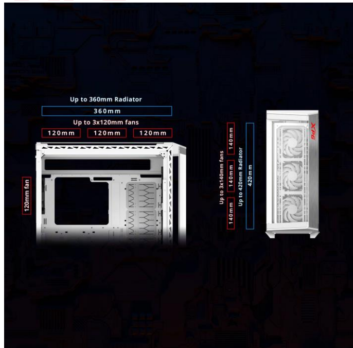
Enhanced Compatibility for Advanced Cooling Solutions