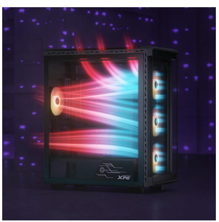
Unleash the Power of Synchronized Lighting Optimized Airflow and Xtreme Cooling Efficiency