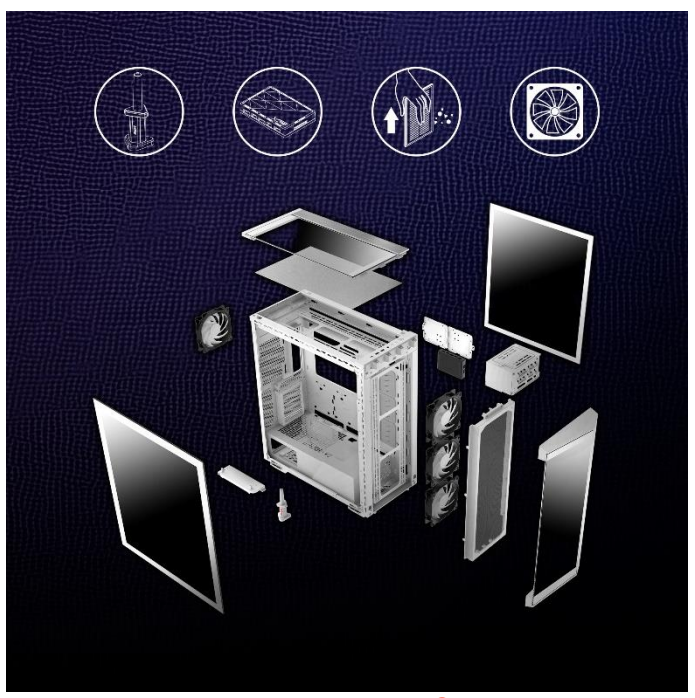
Easy Building, Easy Cleaning