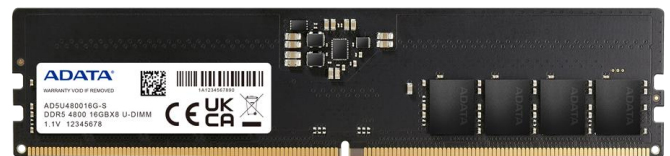
16GB x8, 32GBx16