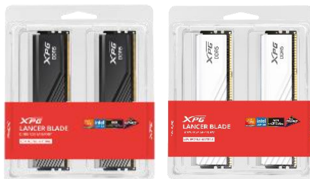
Dual Tray Package