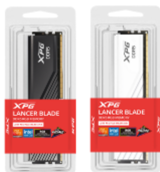
Single Tray Package