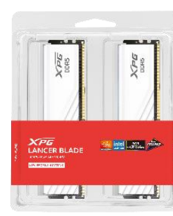
Single Tray Package