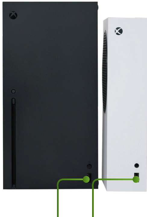
USB type-A0 (10Gbps)