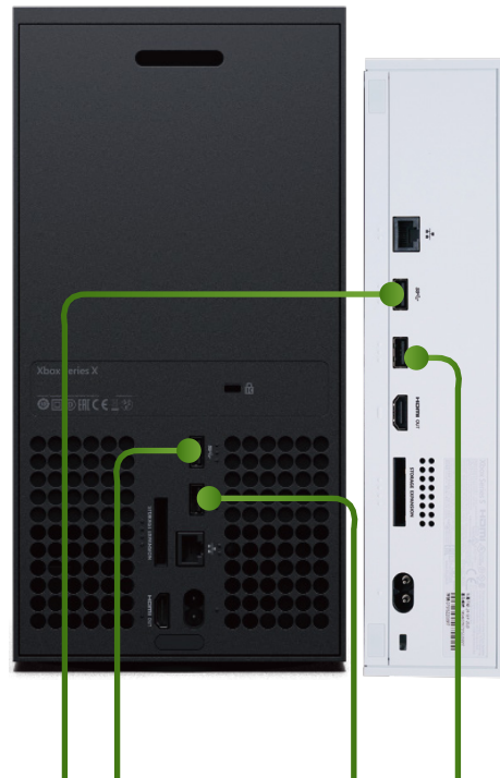
USB type-A1 (10Gbps)