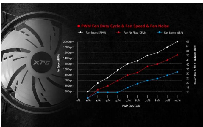
EFFICIENT PWM DESIGN