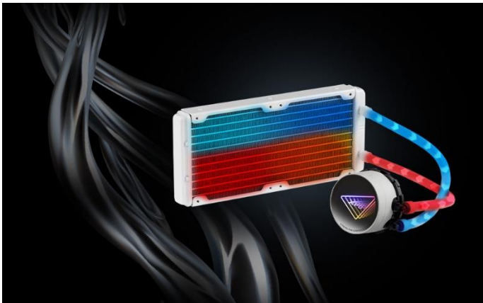
Extreme Performance CPU Cooler