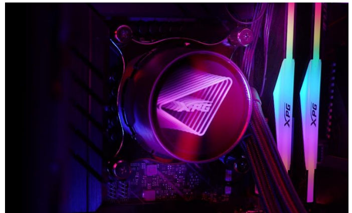
LATEST INTEL & AMD PLATFORM SUPPORT