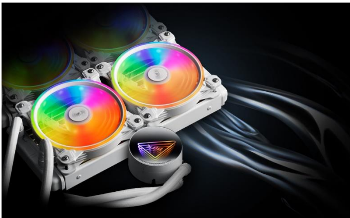
INFINITE MIRROR PUMP DESIGN

An All-In-One CPU Liquid Cooler with industry-leading engineering from Asetek, XPG LEVANTE X provides excellent CPU heat management. This reliable, high performance Liquid Cooling solution ensures smooth system operation for an optimal gameplay experience.