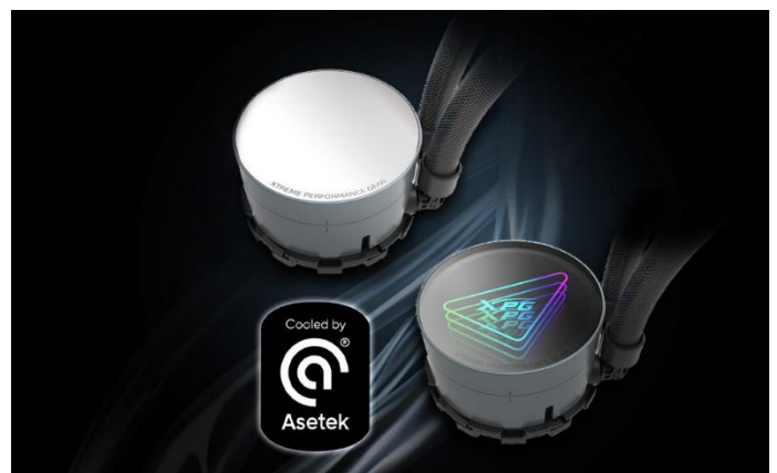
Asetek 7th Gen PATENTED CPU COOLING SOLUTION