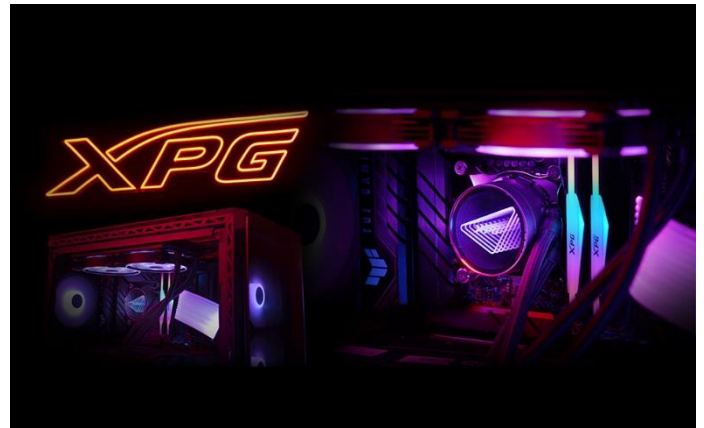
Smooth RGB lighting effect